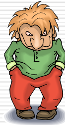
Howie Fine Birkbeck College